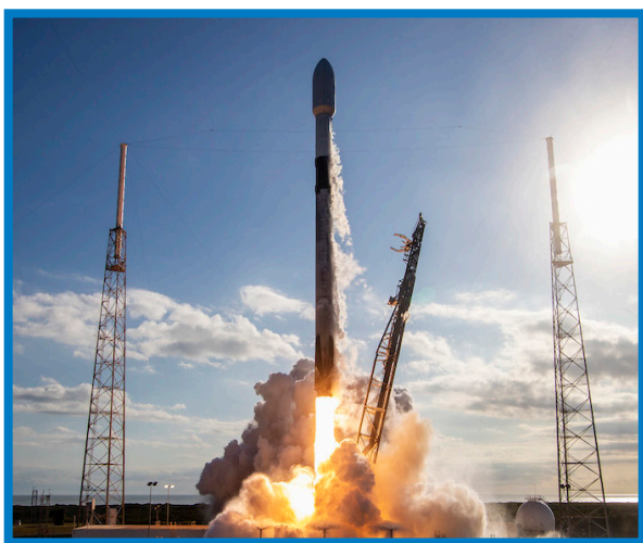
A SpaceX Falcon 9 rocket launch from Cape Canaveral

PulseR, LLC is the premier manufacturer of ruggedized catalog and custom magnetic components supporting the Commercial and Military Space Markets. These components are utilized in mission-critical applications for satellites, launch vehicles, space stations, and manned and unmanned spacecraft.